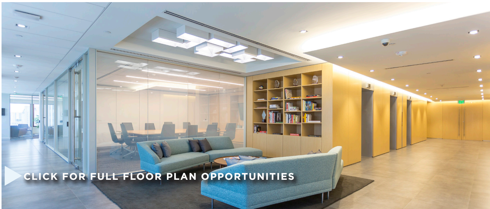
▶ CLICK FOR FULL FLOOR PLAN OPPORTUNITIES