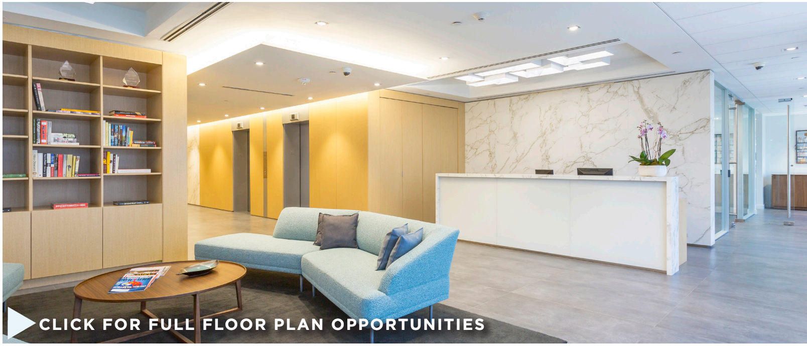
▶ CLICK FOR FULL FLOOR PLAN OPPORTUNITIES