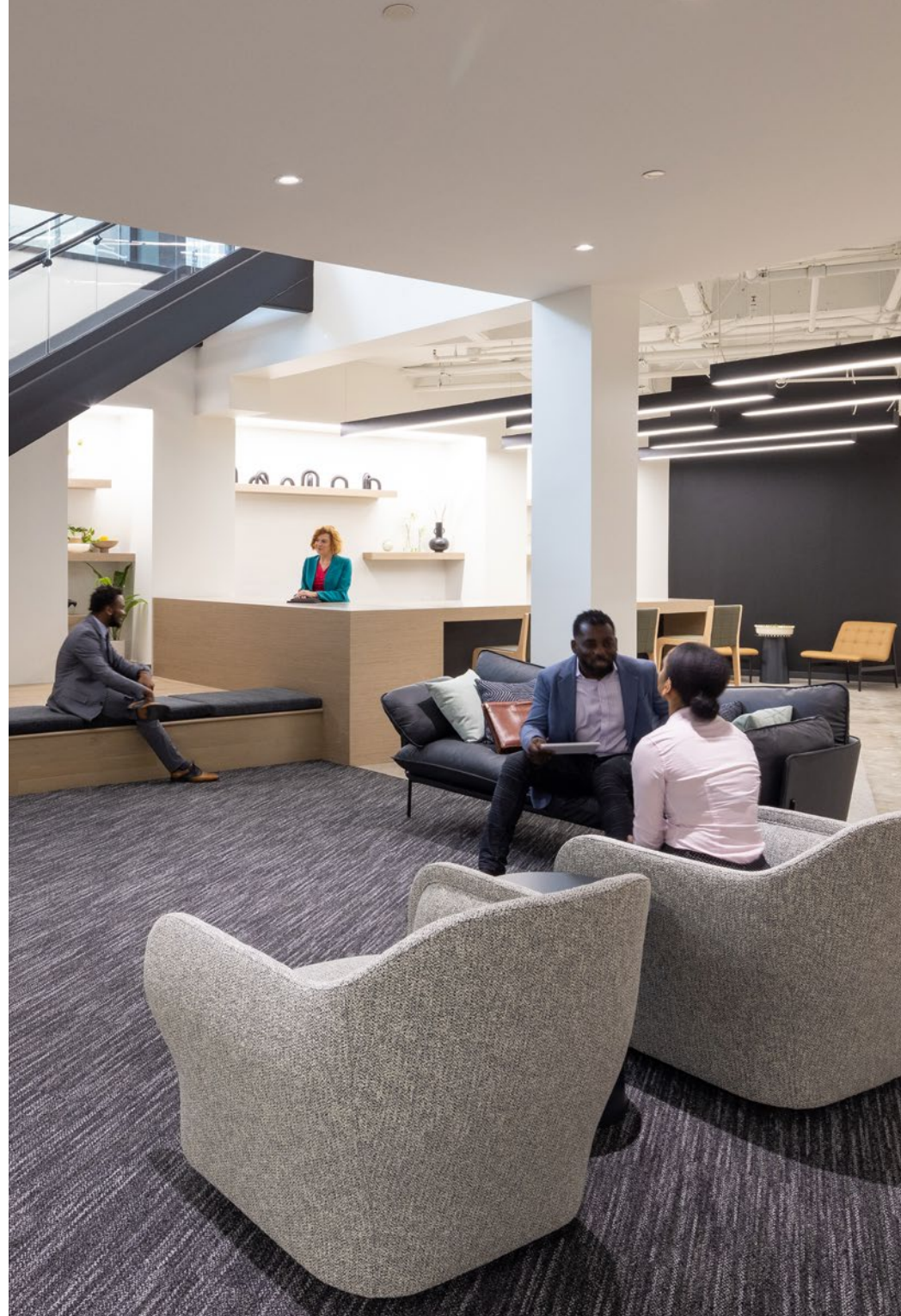
Lower level lounge | For focus work, meetings or breaks