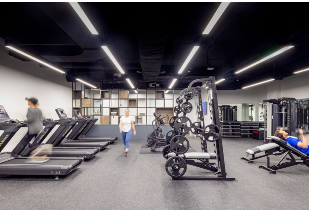
Fitness club | Featuring cardio and strength equipment