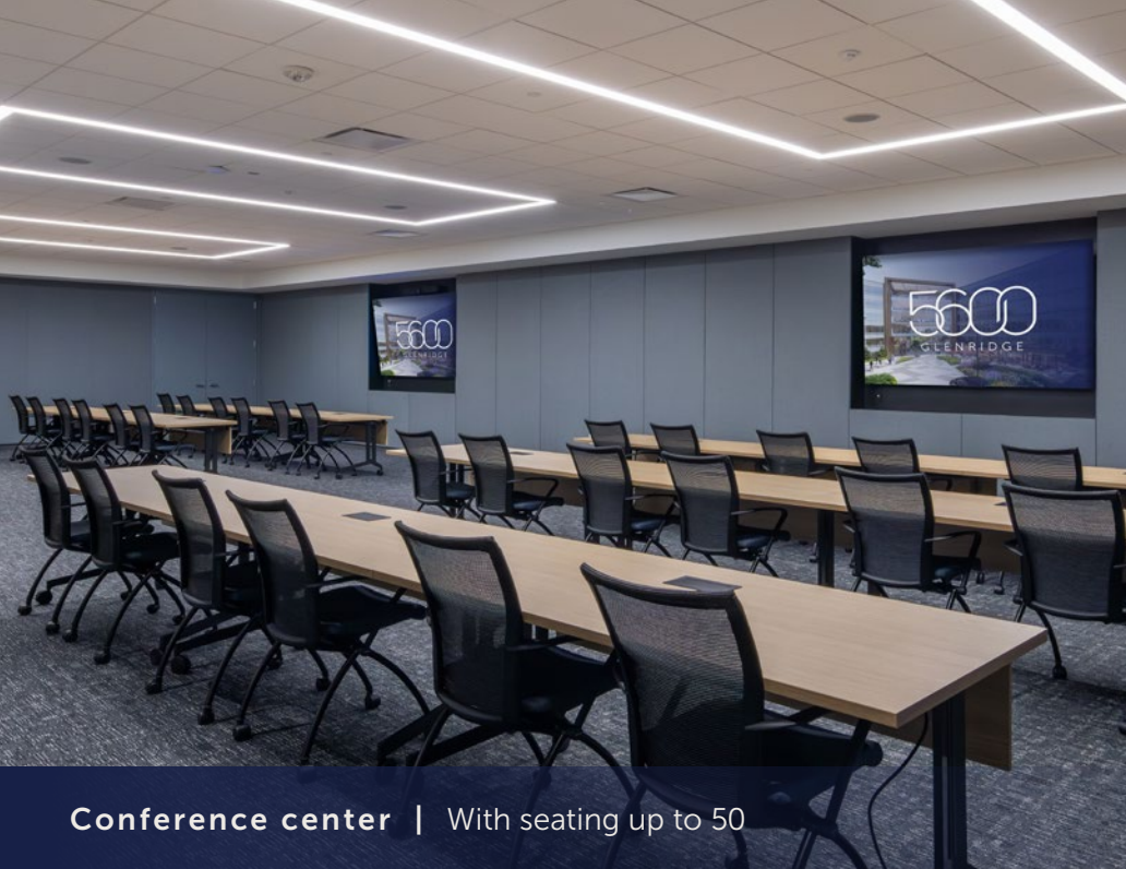
Conference center | With seating up to 50