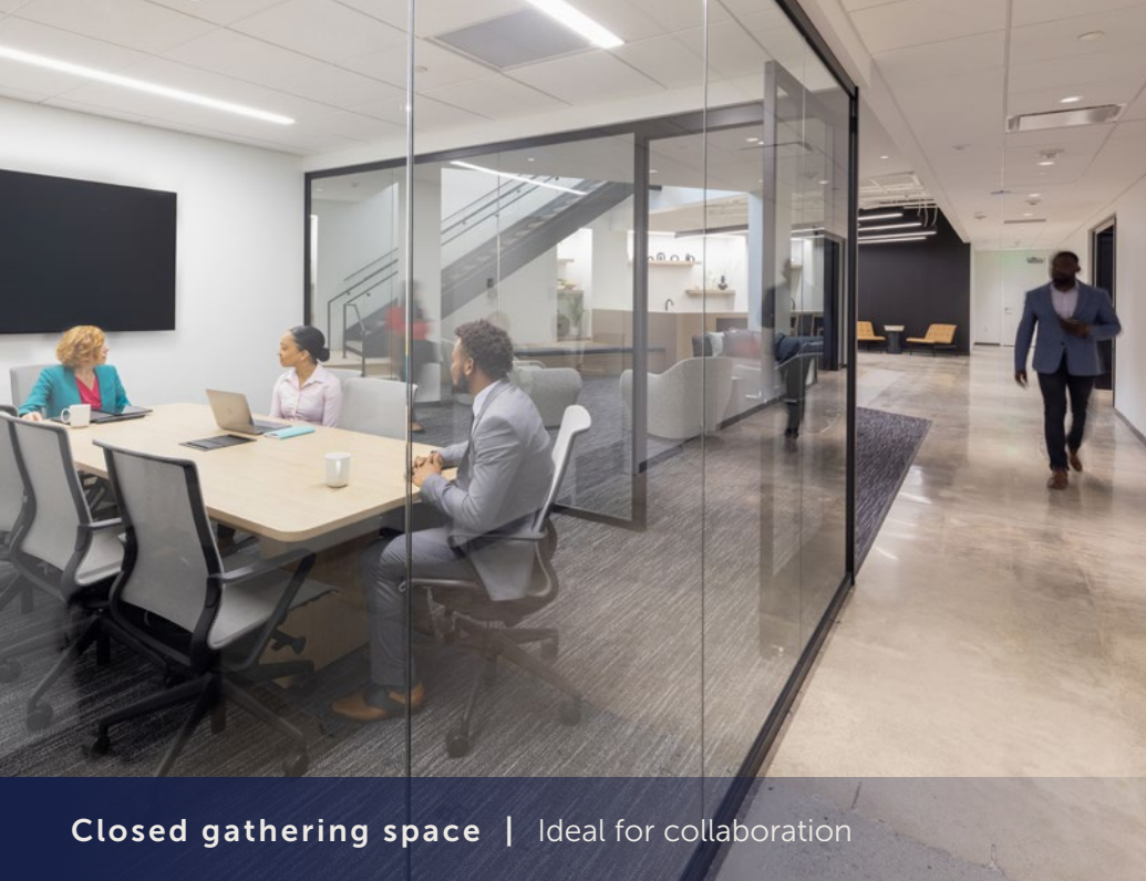
Closed gathering space | Ideal for collaboration